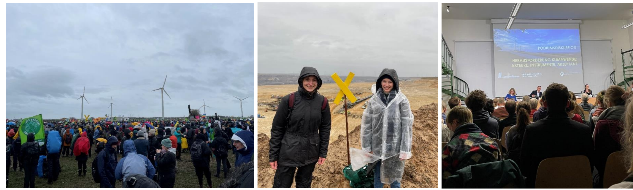
Images 2-4: (From left to right, self-taken pictures) Demonstration near Lützerath, authors in the field, podium discussion in Göttingen