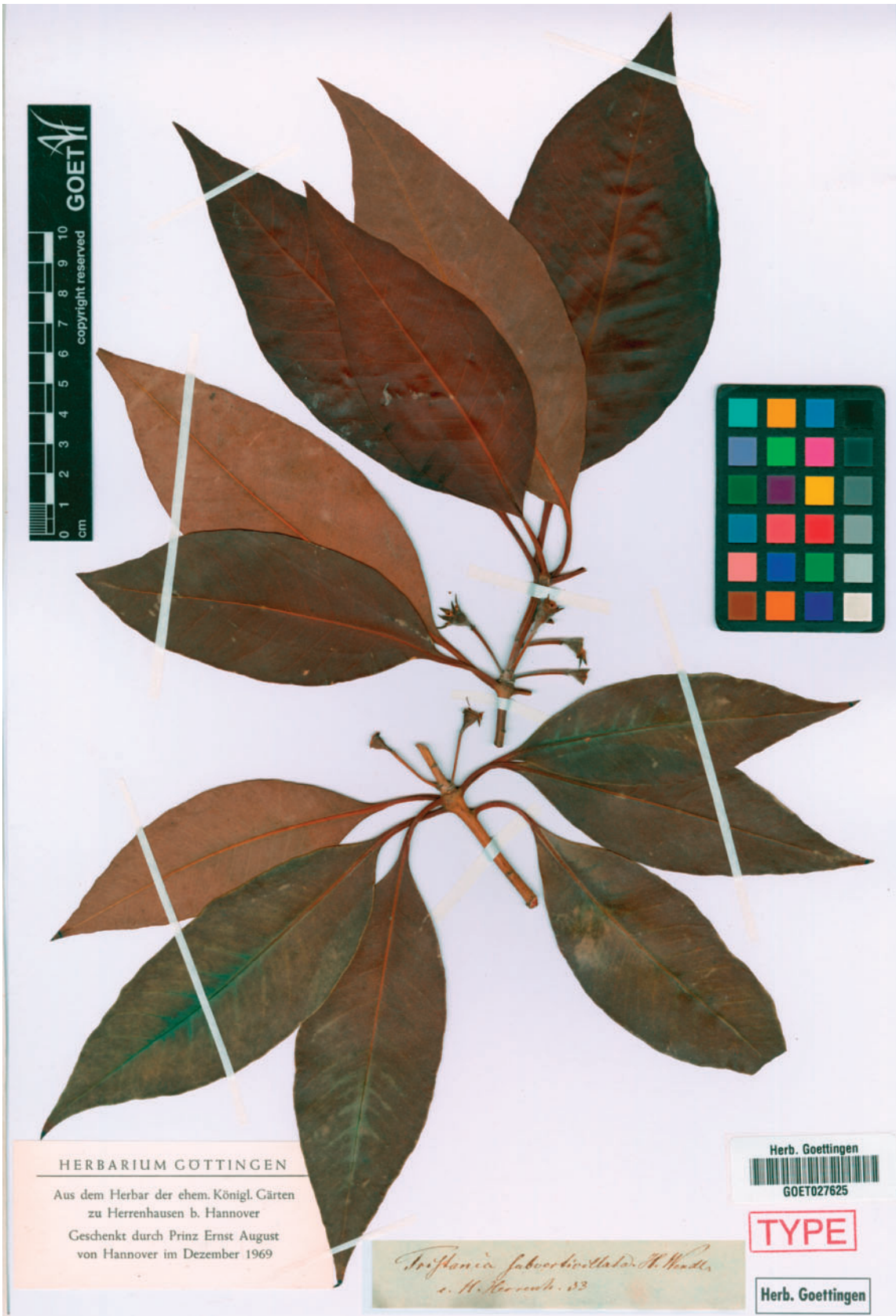
Fig. 13. Lectotype of Tristania subverticillata – GOET 027625 (sheet 1 of 2).