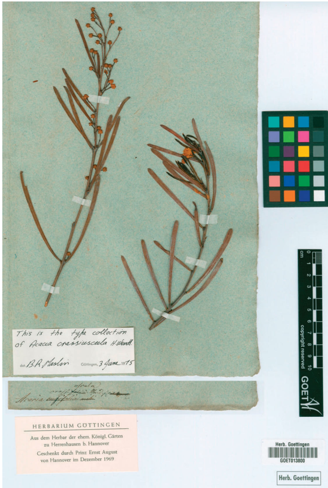
Fig. 2. Lectotype of Acacia crassiuscula – GOET 013800.