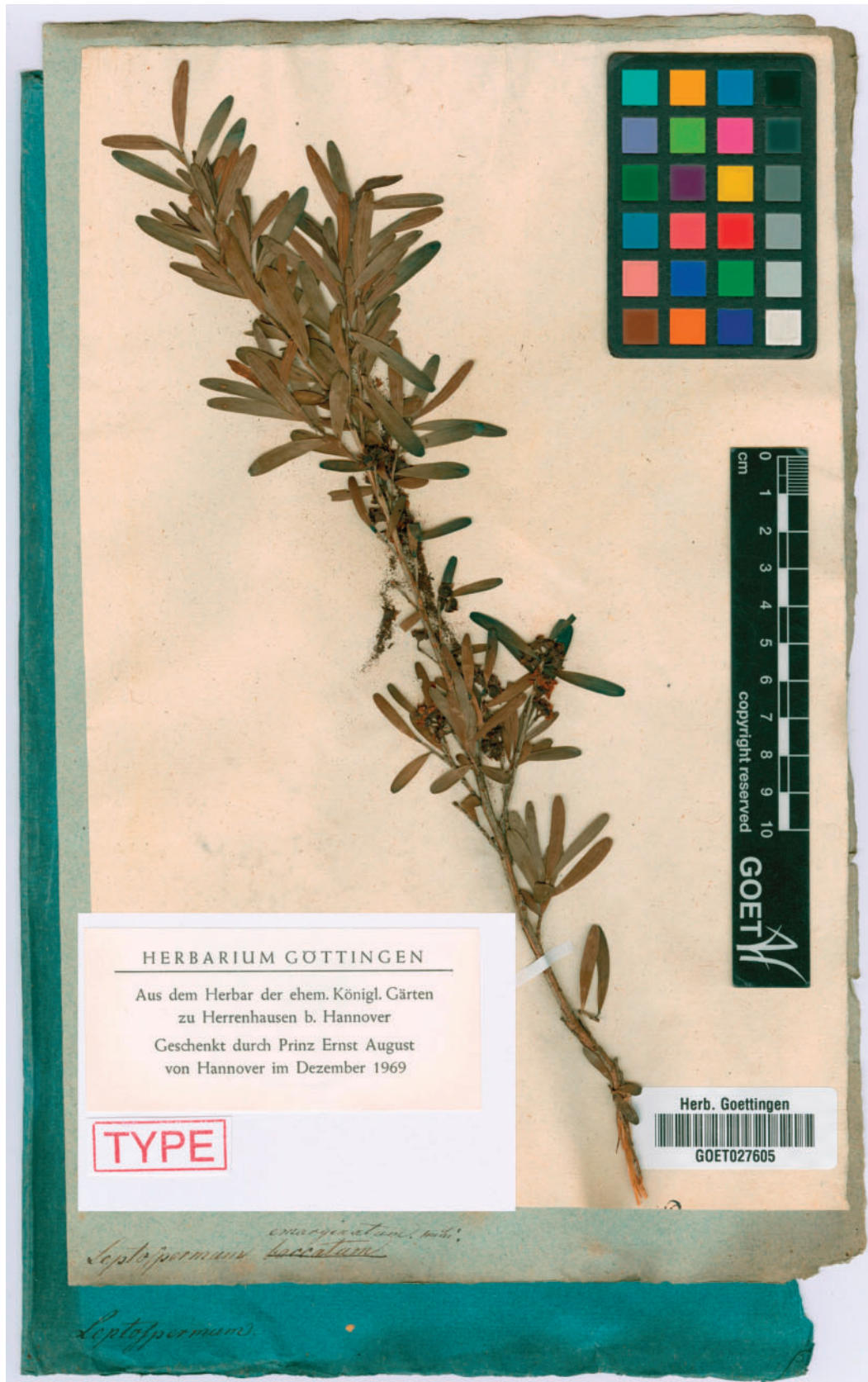
Fig. 9. Lectotype of Leptospermum emarginatum – GOET 027605.