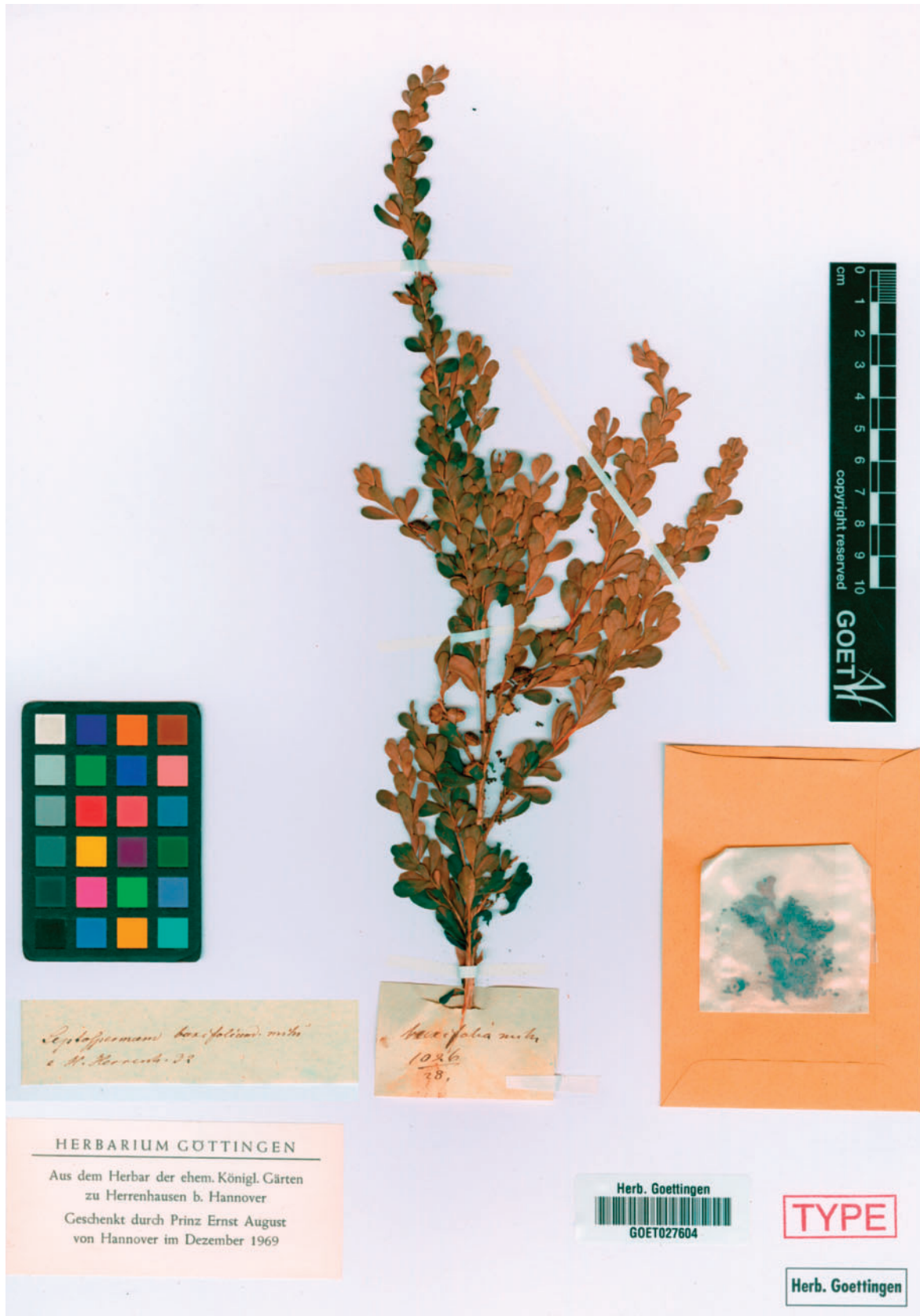
Fig. 8. Lectotype of Leptospermum buxifolium – GOET 027604.