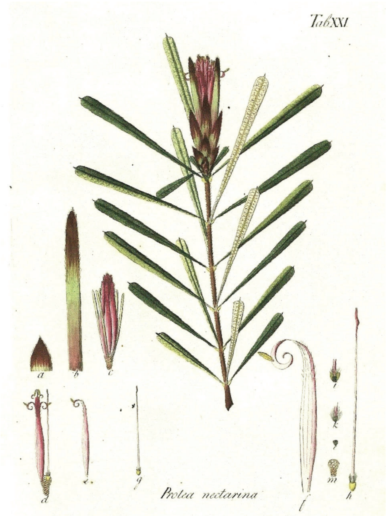
Fig. 15. Lectotype of Protea nectarina , in J.C.Wendland, Sertum Hannoveranum 1(4): tab. 21 (1798).