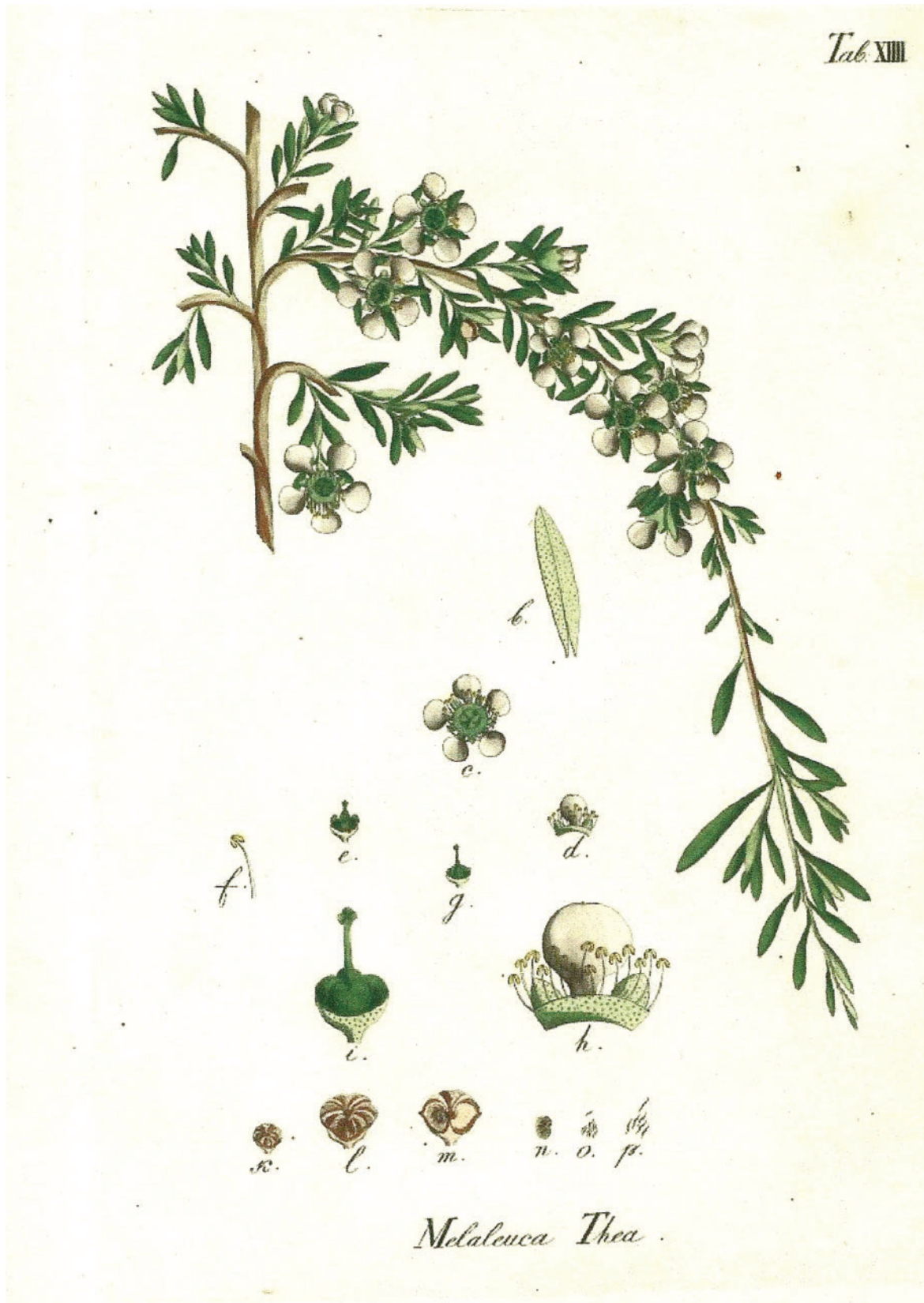
Fig. 12. Lectotype of Melaleuca thea , in H.A.Schrader & J.C.Wendland, Sertum Hannoveranum 1(3): tab. 14 (1797).