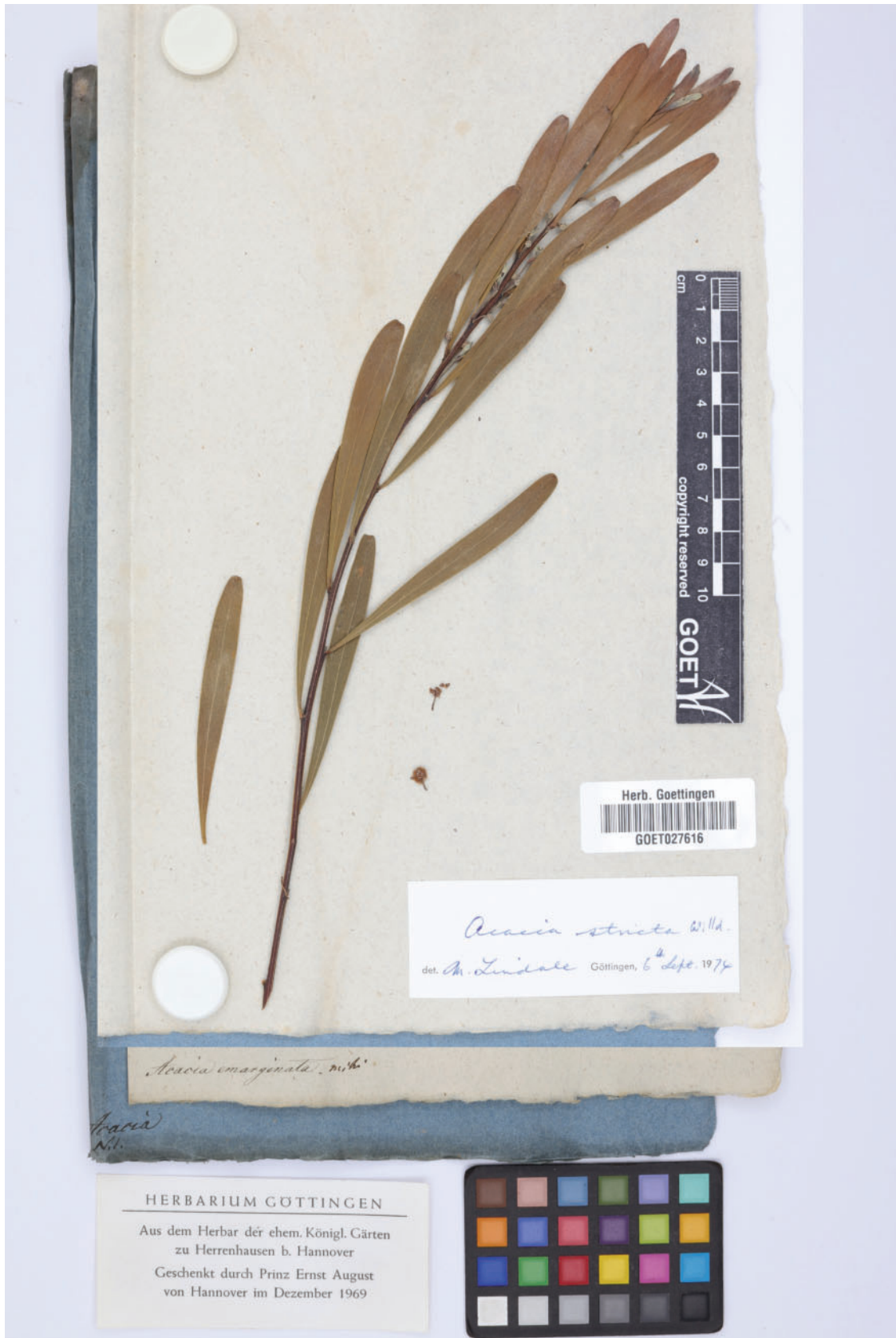
Fig. 4. Lectotype of Acacia emarginata – GOET 027616.