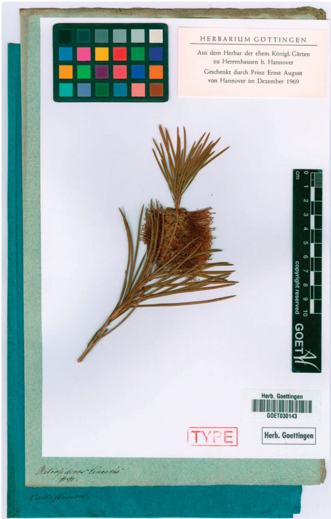
Fig. 11. Lectotype of Melaleuca linearis – GOET 030143.