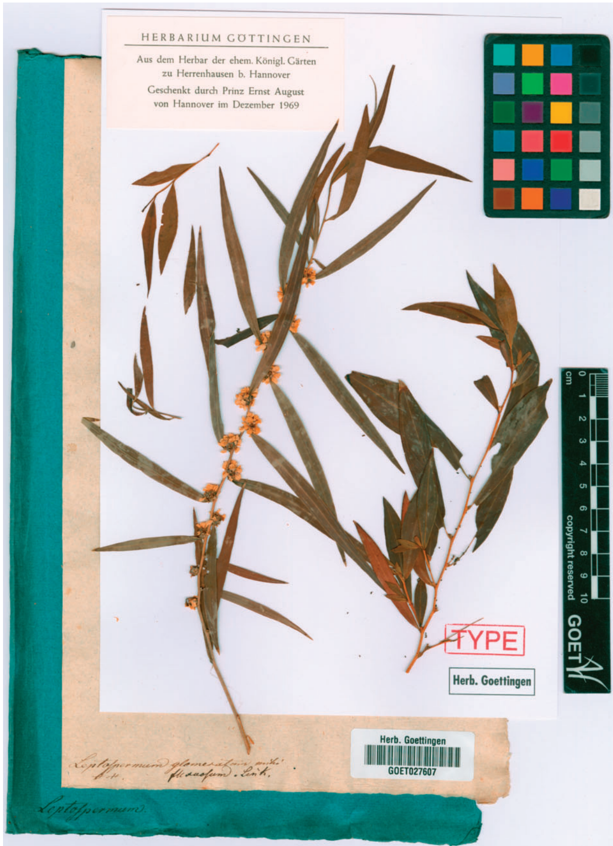
Fig. 10. Lectotype of Leptospermum glomeratum – GOET 027607.