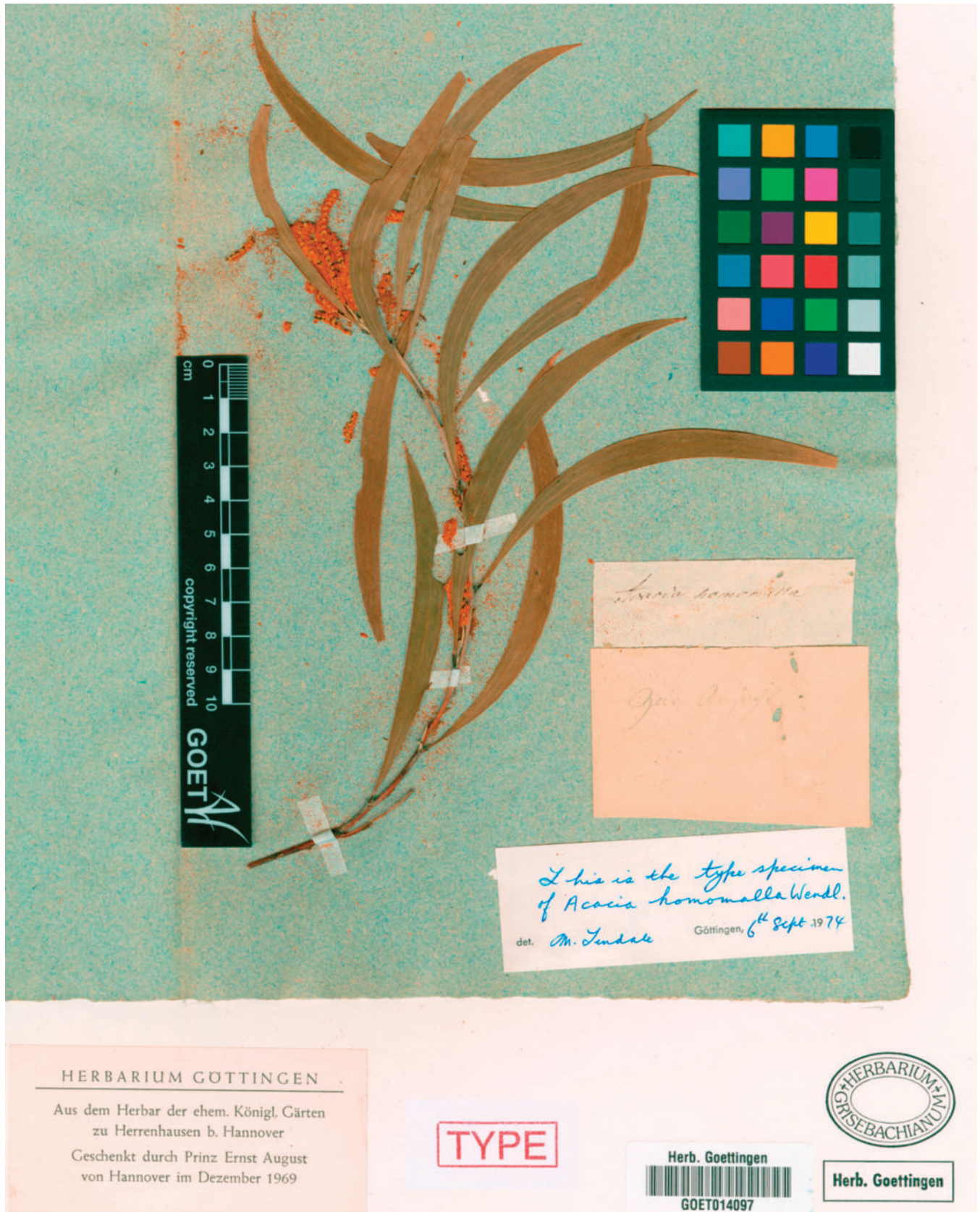
Fig. 5. Lectotype of Acacia homomalla – GOET 014097.