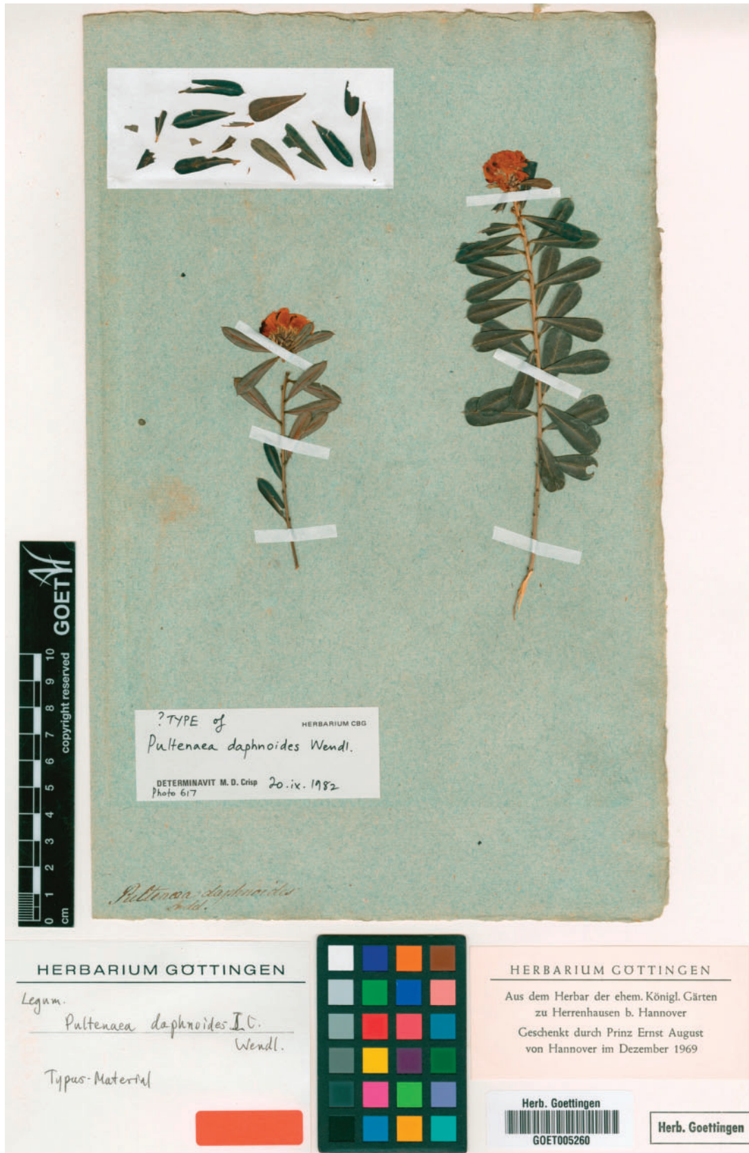
Fig. 6. Lectotype of Pultenaea daphnoides – GOET 005260.