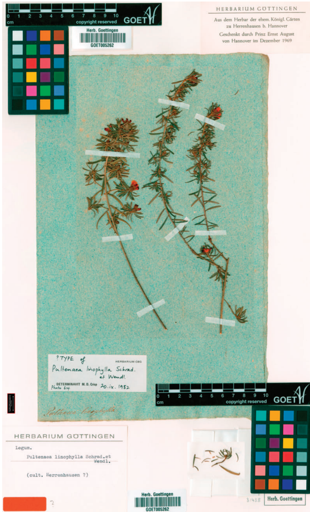
Fig. 7. Lectotype of Pultenaea linophylla – GOET 005262.