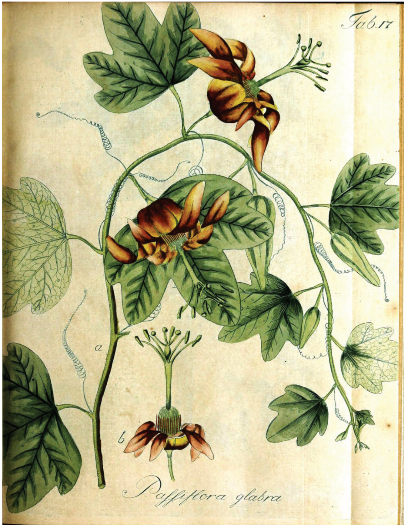
Fig. 14. Lectotype of Passiflora glabra , in J.C.Wendland, Collectio Plantarum 1: tab. 17 (1805).